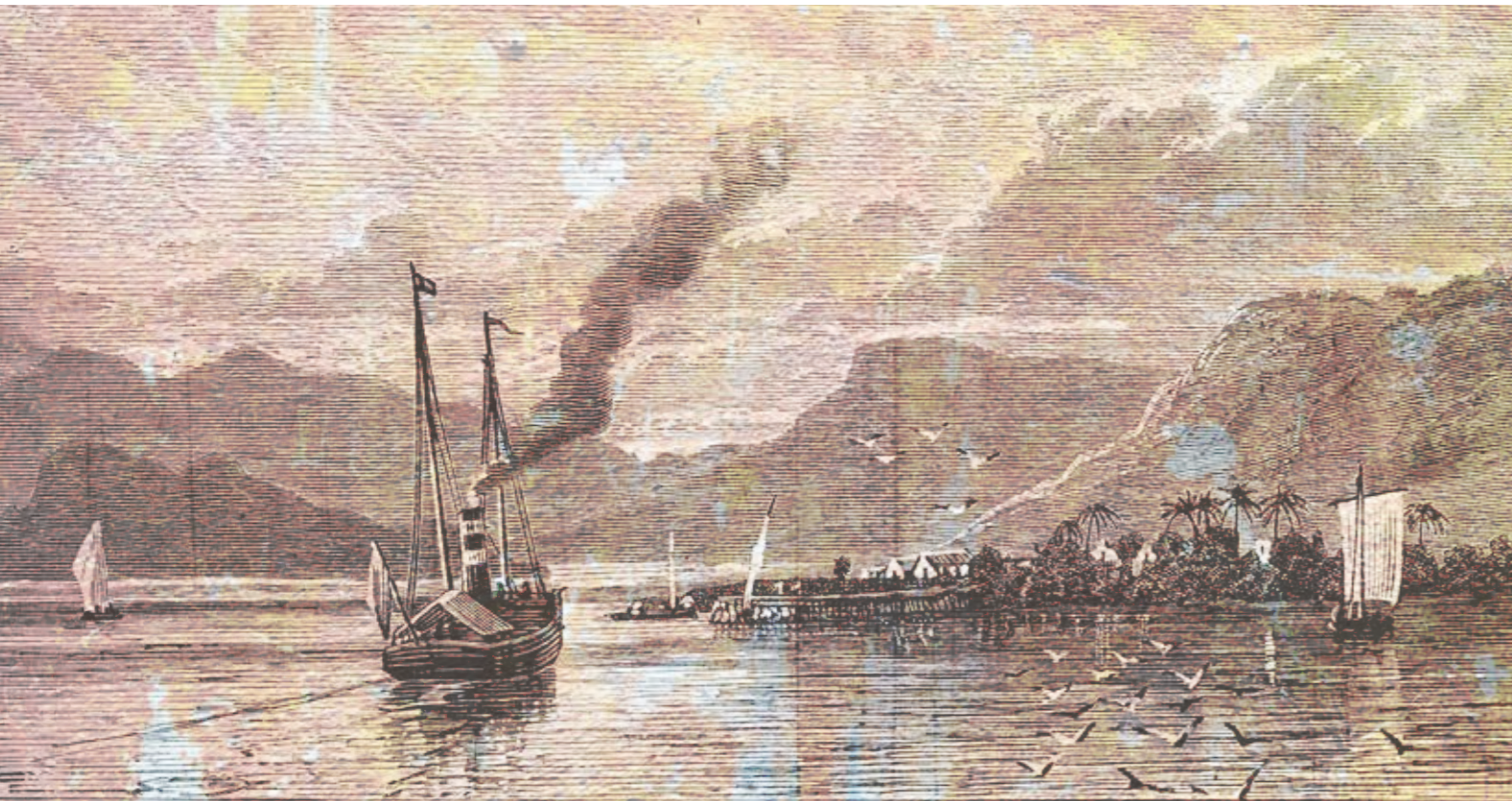
ON THE COAST OF COSTA RICA.

Belize, Costa Rica, El Salvador, Guatemala, Honduras, Nicaragua, and Panama. The majority of these are famous for their high quality sipping rums.